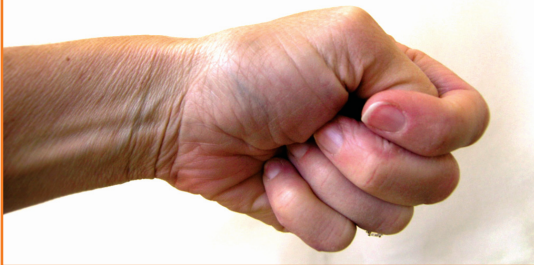
Figure 2 and 3: Finkelstein maneuver, a helpful test to diagnose de Quervain's Tendonitis. Figure 2 shows the first dorsal compartment relaxed; Figure 3 shows the compartment stretched when the fist is bent toward the little finger.

Tenderness directly over the tendons on the thumb-side of the wrist is the most common finding. A test is generally performed in which the patient makes a fist with the fingers clasped over the thumb. The wrist is then bent in the direction of the little finger (see Figure 2 and 3 ). This maneuver can be quite painful for the person with de Quervain's tendonitis.